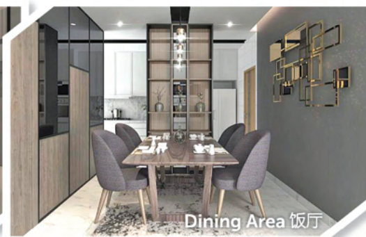
Dining Area 饭厅