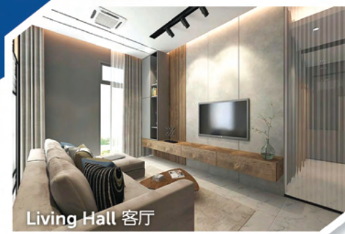
Living Hall 客厅

Meet the French in Local Town An unique French designed residential area, you will miss your home every day